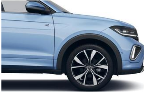
FESER ✕ GRAF