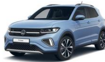
FESER ✕ GRAF