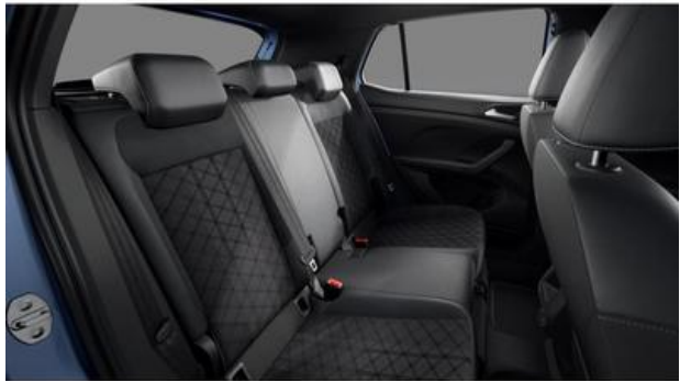
FESER ✕ GRAF