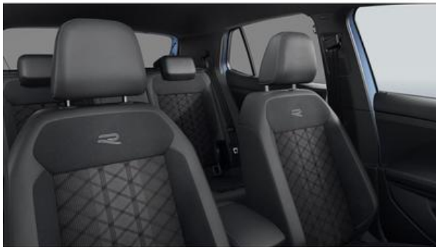
FESER ✕ GRAF